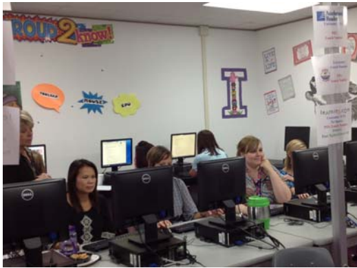
Port Neches Elementary