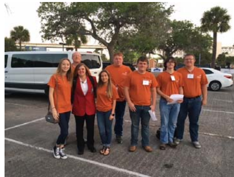
SkillsUSA State Competitors