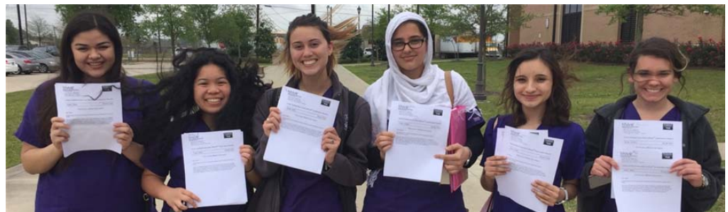
Senior HOSA students with their passing CNA results