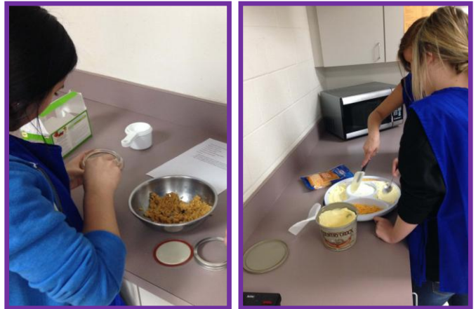
Principles of Human Services students help prepare lunch for the CTE Advisory Committee meeting.