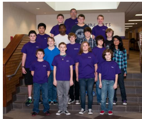
PNMS Robotics Team