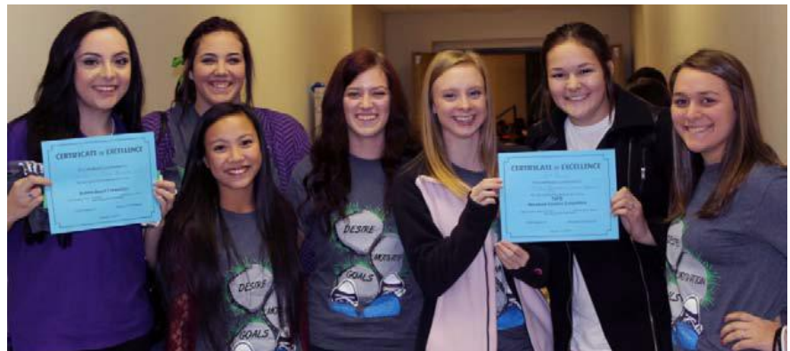
Peer tutors bring their field-based experience to TAFE contest.