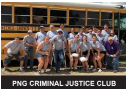
PNG CRIMINAL JUSTICE CLUB

The PNGHS Criminal Justice students have been busy this fall. Events include volunteering at the Port Arthur Guns and Hoses Benevolent Fund annual clay shoot fundraiser in September and at the Port Neches Police Department's National Night Out event in October.